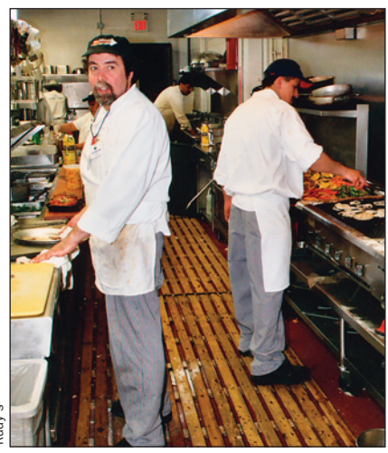
The master chef awaits your order. Rudy's has never failed to meet a customer's request.

Inflight will get it. On the orders table during a B/CA visit was a wide variety of items, ranging from exotic cheeses to Milk Bones for one exec's dog.