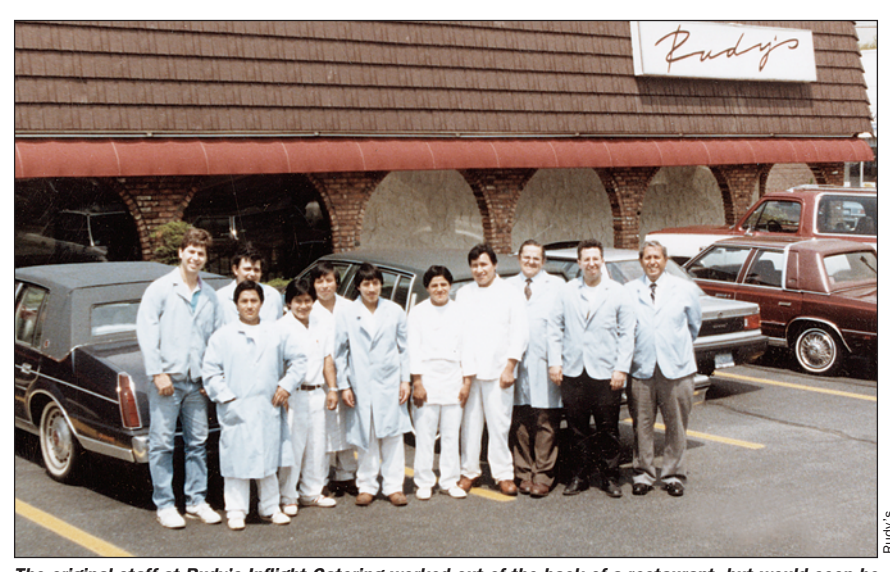
The original staff at Rudy's Inflight Catering worked out of the back of a restaurant, but would soon be in the forefront of the business aviation catering industry.

In their first year, the brothers were producing meals for approximately 16 aircraft a week. A year and a half later, they were doing 15 to 20 aircraft a day, operated two vehicles and had six employees — three of whom still work for them — and were fast outgrowing their backroom space. Two other facts helped motivate a search for their own digs. First, NetJets wanted to contract with a caterer, but said the brothers would have to grow their services and capabilities substantially if they hoped to win