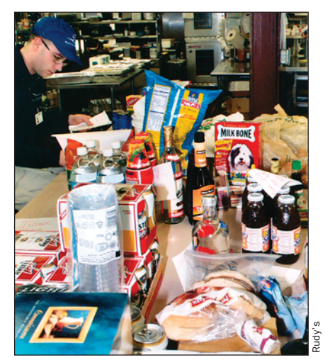
From special brands to dog treats, Rudy's' policy is, "You want it, we'll get it for you."

be exposed to contamination, and establish a procedure unique to a specific operation.